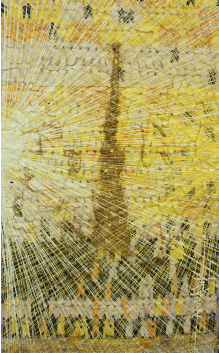
Olaniyi R. Akindiya, All that Glitters , 2013, mixed media, 60" x 44"